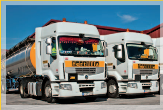
RENAULT PREMIUM 430